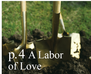
p. 4 A Labor of Love